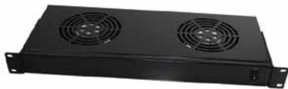
1U fan unit 19" Part No.: FAN2 = 2 fans unit FAN4 = 4 fans unit