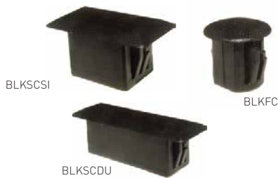
Panel blanks Part No.: BLKSCSI = Blank SC simplex BLKSCDU= Blank SC duplex BLKFC = Blank FC or ST