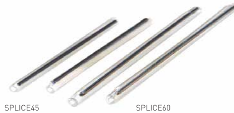
Splice protectors Part No.: SPLICE45 = Splice 45mm SPLICE60 = Splice 60mm