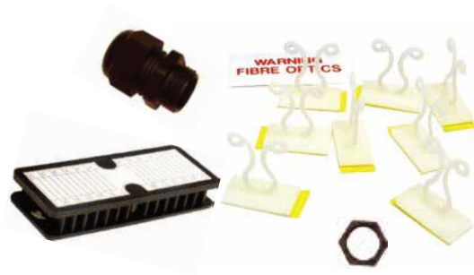
Fiber management kits (1 cable gland PG13.5, 8 Bunny clips, 1 Splice bridge 24 Fibers and 1 warning label) Part No.: FMKIT